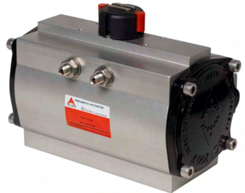
DOUBLE ACTING "ADA"