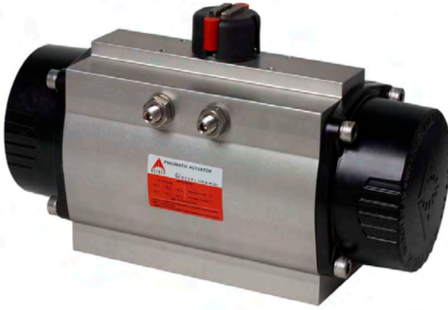
SPRING RETURN "ASR"